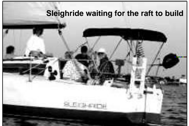
Sleighride waiting for the raft to build