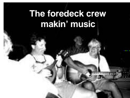
The foredeck crew makin' music