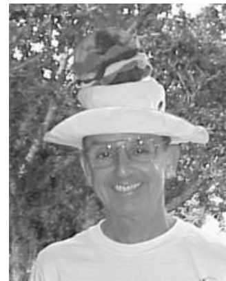
Ned Buck's Cheeseburger In Paradise Hat

Labor Day Weekend Cruise... Sept 4-6. Destination tbd (suggestions?)