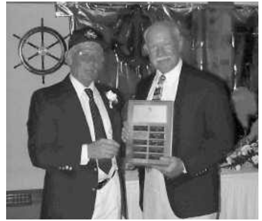
Stu Shadbolt USSA Sportsmanship Award