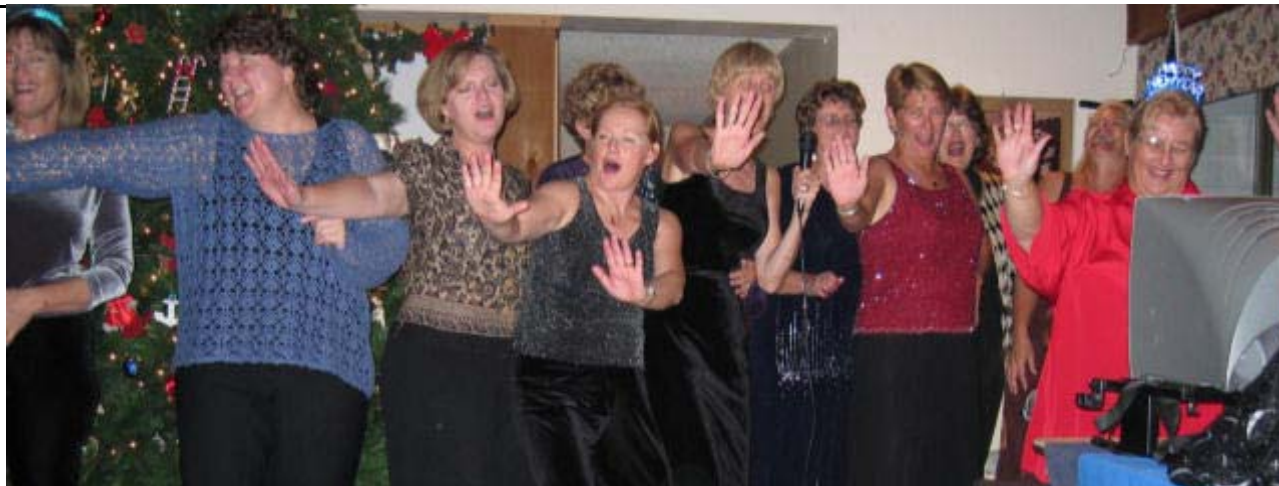
A little crazy Karaoke at the New Years Eve Party