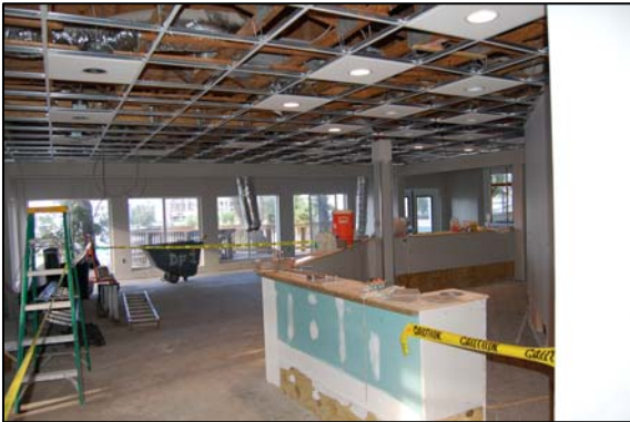
New Bar looking toward back

The renovation project is proceeding and we will be needing members to volunteer to help around the clubhouse soon to set things back up. If you haven't been down to the club it really has changed. The grid work for the drop ceiling is installed and most of the lights are installed in it. The drywall work is being completed. The Great Hall extension is about done, just waiting on the paint. You can really get an idea of the size of the new bar area now.