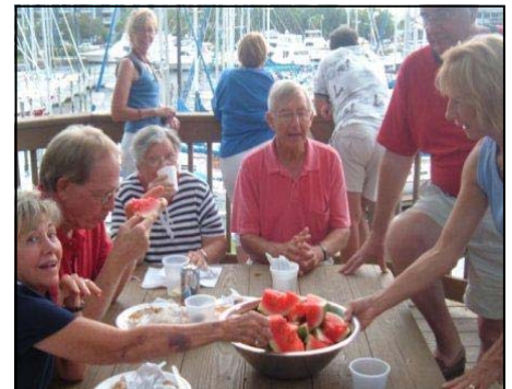
Bryan's, Kowalski's & Alexy's