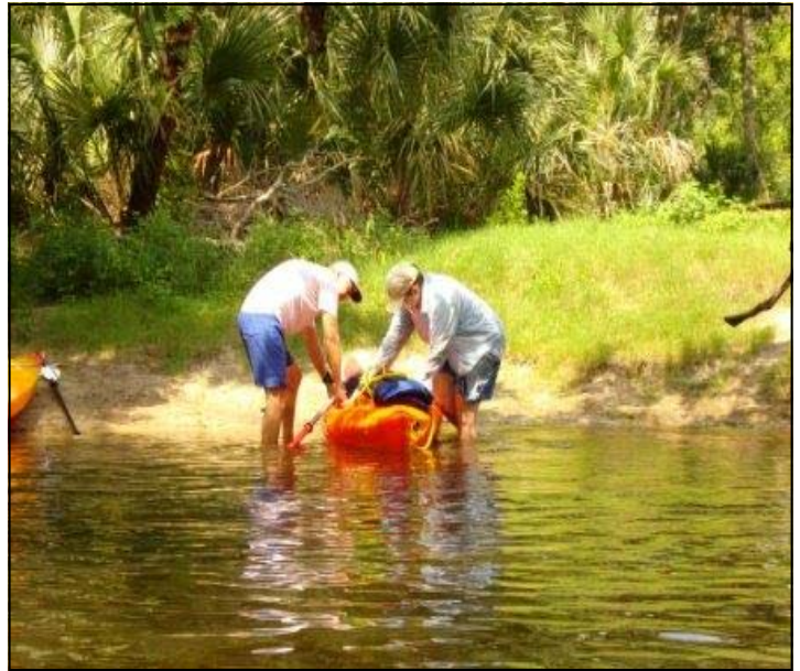
Turkey Creek Kayaking Trip in June