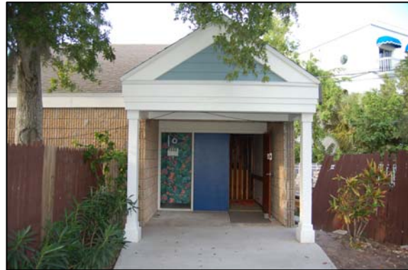
New Front Entrance

We also have a new front entrance. New doors were installed on July 9 th after this picture. The new roof is completed and it looks good. The plan is still to be completed by the end of July. I am sure there will be things that need completing after that but Neal is still expecting the major work completed by the end of July. We are still planning our Grand Reopening for September 22. I am sure we will be asking for help from all the club members to come down and help finish the club.