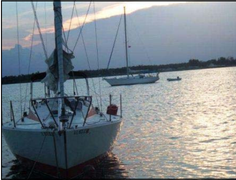
LEFT: Sleighride awaiting her crew