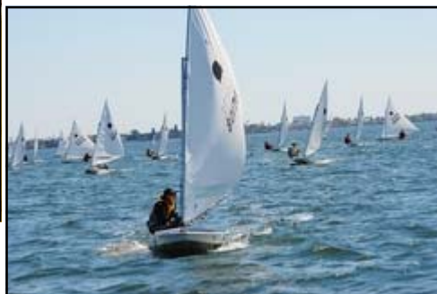
2010 Sunfish International Masters Championship Regatta, March 19-21