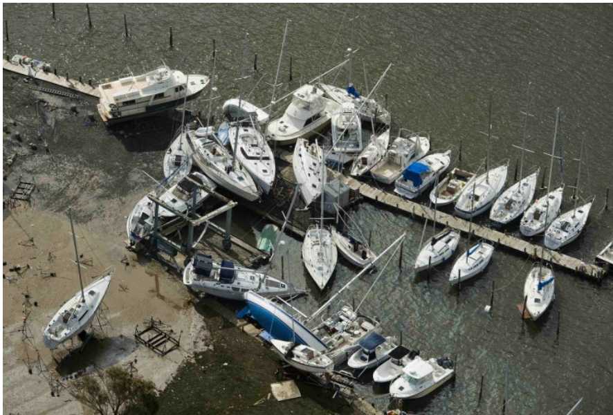
Damage to a local marina during Hurricane Sandy