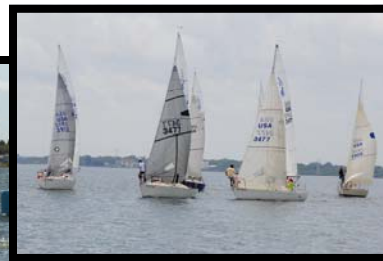
Big Boat Weekend