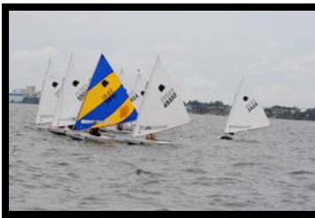
Small Boat Weekend