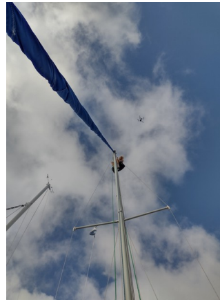
View of the MYC docks.