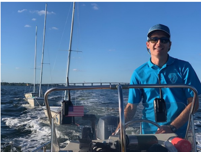
Above is the education director cautiously towing 420s down the ICW.

October was a quiet month for educational programs at MYC. Eau Gallie Yacht Club’s youth program put on an impromptu Halloween small boat regatta. Four of our 420s made an appearance at the regatta.